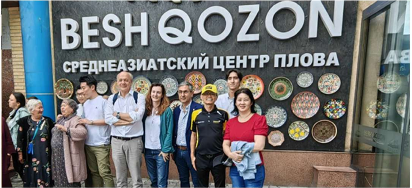
Authentic Uzbekistan kebab, Plov, Manti, Tandir, Lagmon are one of the best in the world