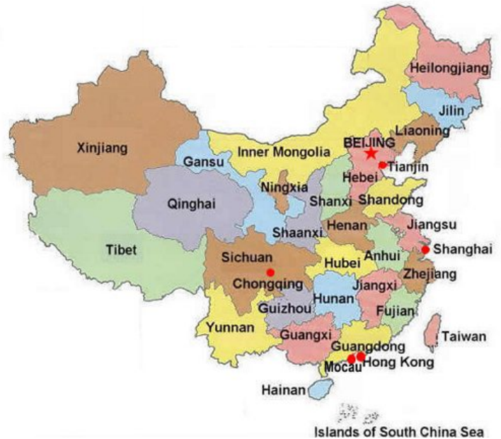
Map of China