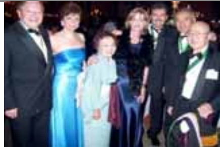
Mexicans welcome Japanese