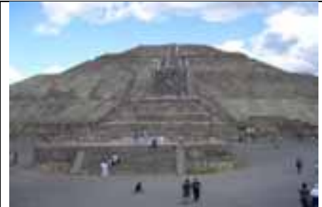
Just one of Mexico's stunning pyramids