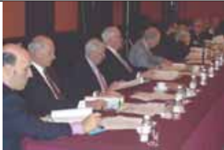
Hardworking Councillors, Mexico